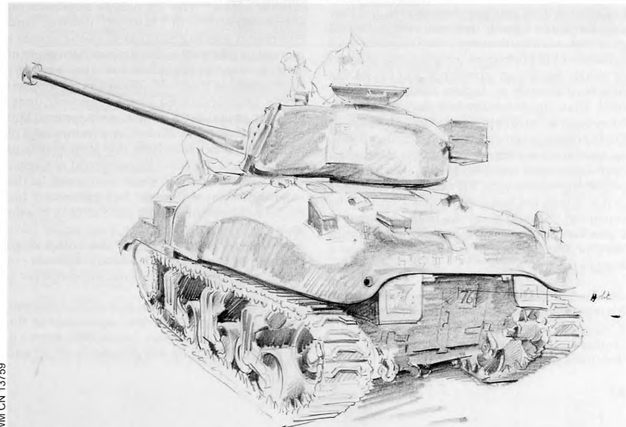
CWM CN 13759