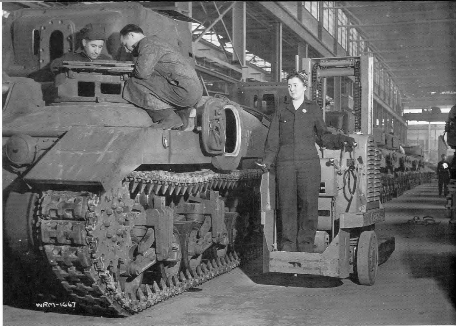
Ram tanks in production at the Montreal Locomotive Works, July 1942.

The loss of nearly a year's lead-time on military orders had serious consequences. Industry received its first orders for tanks in May 1940, but a year passed before the first Canadian-built tank, an already obsolete Valentine, appeared. The prototype of the Ram followed in July 1941. 25 Full-scale production did not begin until early 1942, by which time the Sherman was already rolling off assembly lines in the United States. Between the inception of the idea of Canadian tanks and actual production lay a jungle of administrative, economic, technical, and military confusion. The central problem was perhaps the most elementary one: Canadians knew virtually nothing about designing, building, or testing tanks, simply because there were hardly any tanks in Canada to begin with. That tanks were something new under the sun is evidenced by contemporary accounts of their development in Canada in which the authors struggle to find language to describe vehicles which most Canadians had never seen: "The tank," wrote Maclean's Frederick Edwards, "is comparable to a submarine, only the tank is smaller," while