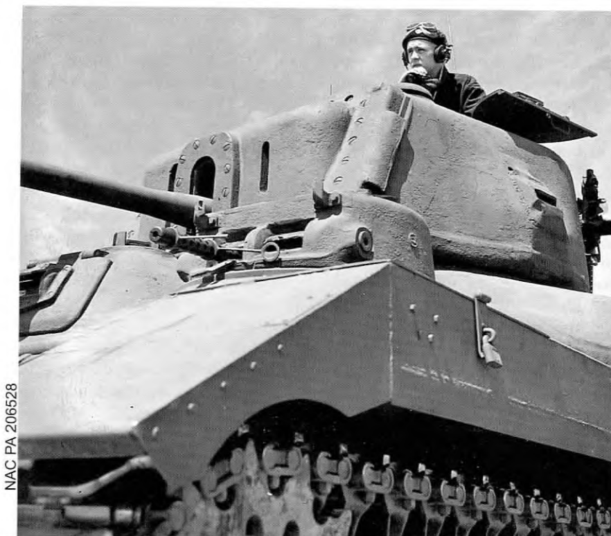
NAC PA 206528

There is no denying that Germany's tanks could be formidable. In one famous incident in the summer of 1944, a solitary Tiger tank crawled from the woods near Caen and left 25